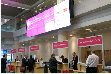
The above image shows the media walls position s an example of how the zone could look and does not represent a final design