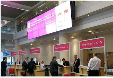
The above image shows the media walls position and example of how the zone could look and does not represent a final design